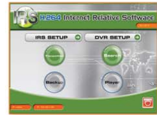
Remote Client Software